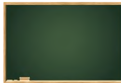
b _ _ _ _