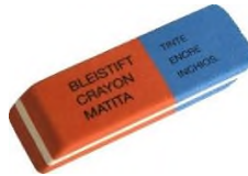
r _ _ _ _