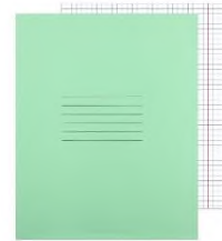
n _ _ _ _